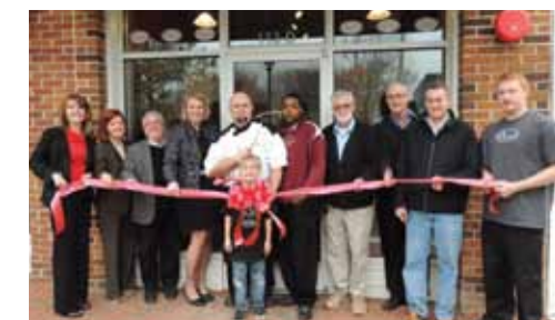
The Chamber of Commerce hosts ribbon cuttings for small businesses.

■ Sew Personal , Screen Printing & Embroidery changed ownership and relocated to 15221 Carrollton Blvd. in December.