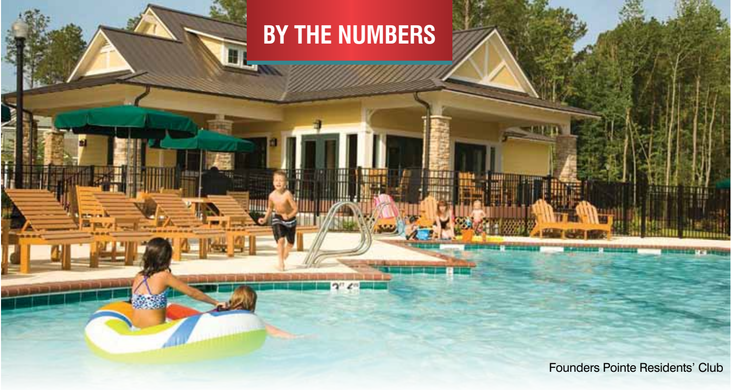
Founders Pointe Residents' Club