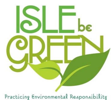
Practicing Environmental Responsibilit in Isle of Wight County, Virginia

In 2009, the County was awarded various grants from the Virginia Department of Environmental Quality (DEQ), the Retail Alliance, and the South Hampton Roads Resource, Conservation, and Development Council to implement the Isle Be Green Plastic Bag Recycling Program. In addition to the grants, the County also focused on obtaining sponsorship for the implementation of this program.